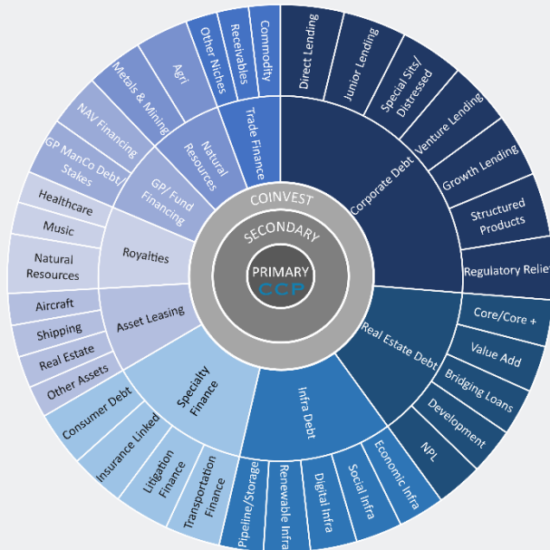
CCP Asset Class Coverage

WITH A TEAM INVESTMENT BACKGROUND STRETCHING BACK TO THE BIRTH OF THE EUROPEAN LEVERAGE FINANCE MARKET IN THE LATE NINETIES, CCP FOCUSES ON PROVIDING, WITHIN THE ALTERNATIVE LENDING MARKETS, SPECIALISED INVESTMENT ADVISORY SERVICES